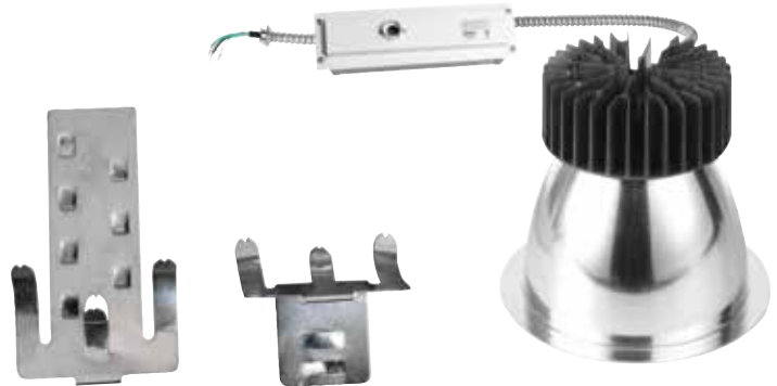
Universal Mounting Clips